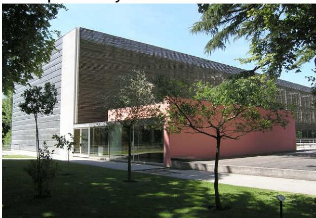
Municipal Library “Almeida Garrett”