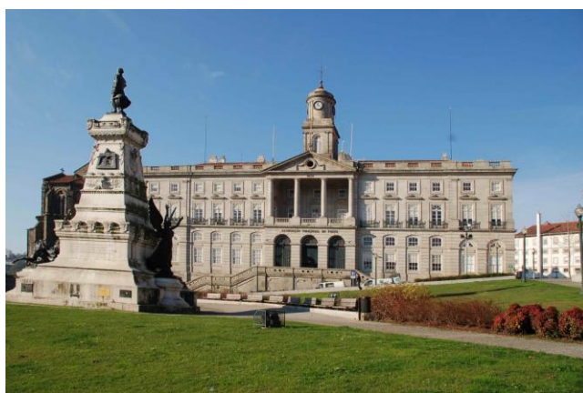
Palacio da Bolsa