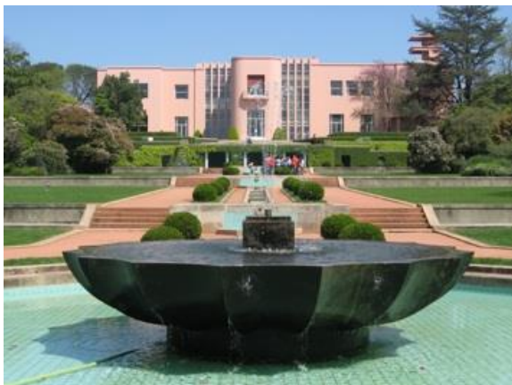
Serralves Foundation and Museum