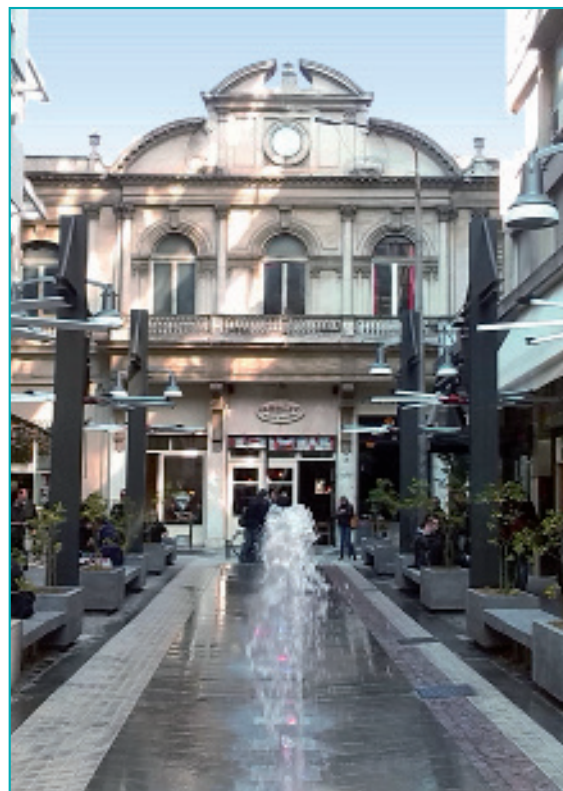
Upgrade of Chrimatistiriou Square with fans, fountains and trees

The project includes the bioclimatic upgrade of Chrimatistiriou (Stock Exchange) Square and a significant portion of the old commercial and business centre of Thessaloniki, a total area of approximately 107,000 m 2 .